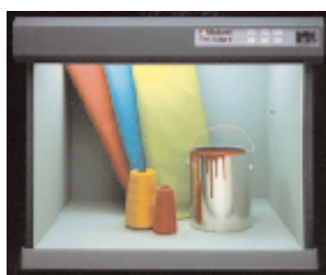
Cool White Fluorescent