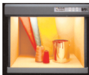
Illuminant "A" (Incandescent)